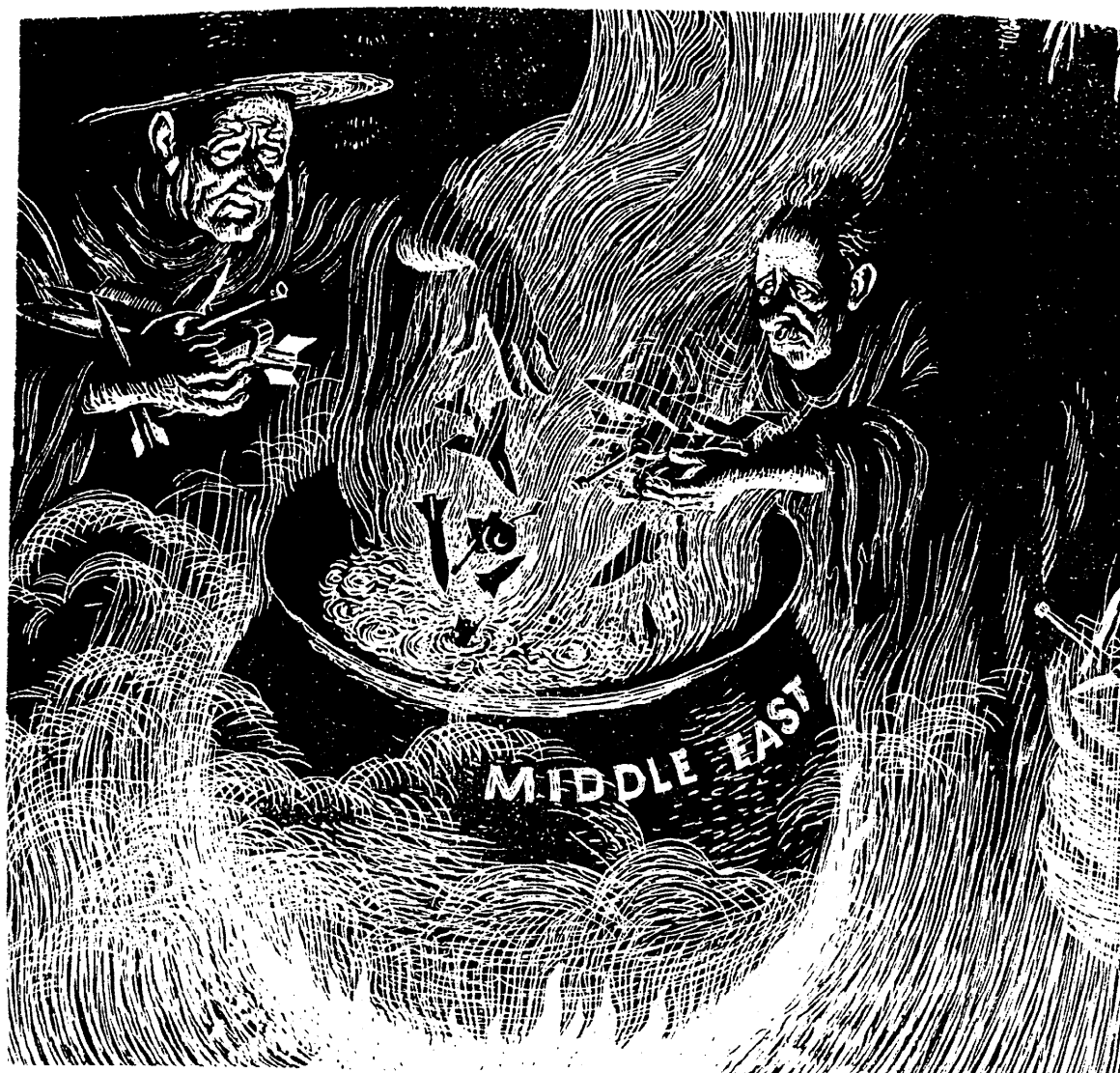
A cartoon from a British magazine, November 1967. The two figures in the cartoon represent Johnson and Brezhnev, the leaders of the USA and the USSR.