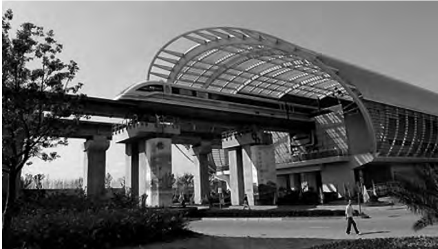
Fig. E2.1 Transrapid train emerges from the stylish station in Shanghai

Construction began in April 2001 of the first commercial Transrapid system. Despite the fact that the maglev was the first revenue-producing point-to-point high-speed maglev in the world, the system was up and running by 2004. The 30km line runs between Pudong Shanghai International Airport and the Shanghai Lujiazui financial district. An end-to-end ride takes about eight minutes. A world record for commercial maglev systems was set on November 12, 2003. A five-section train achieved the top speed of 501 km/h (311 mph) while another vehicle passed at 430 km/h (267 mph) on the adjacent track. The Transrapid in Shanghai has a design speed of over 500 km/h and a regular service speed of 430 km/h. Shanghai Maglev is the fastest railway system in commercial operation in the world. Other maglev lines are under consideration in China.