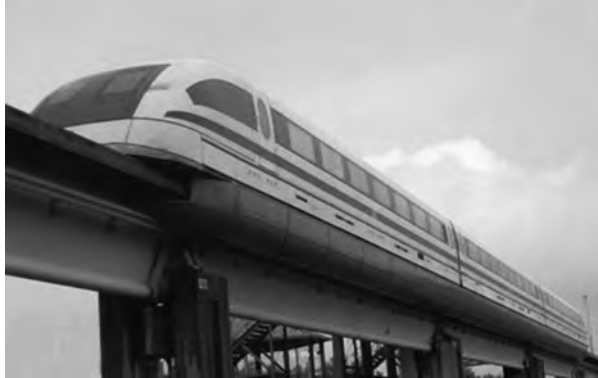
Fig. E1.1 The first commercial maglev line made its debut in December of 2003.

If you've been to an airport lately, you've probably noticed that air travel is becoming more and more congested. Despite frequent delays, aeroplanes still provide the fastest way to travel hundreds or thousands of miles. Passenger air travel revolutionised the transport industry in the last century, letting people traverse great distances in a matter of hours instead of days or weeks.