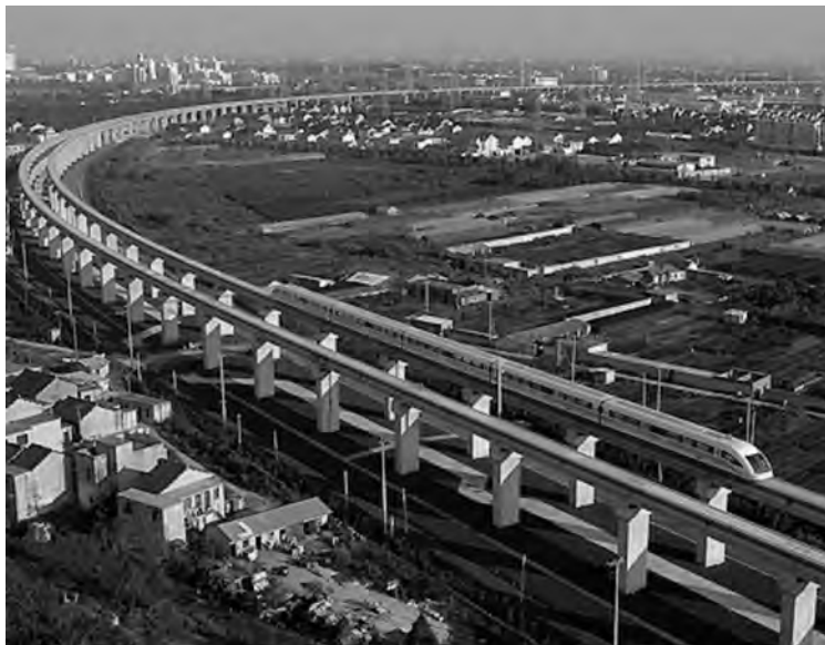
Fig. E2.2 History-making maglev speeds between stations

Construction began in April 2001 of the first commercial Transrapid system. Despite the fact that the maglev was the first revenue-producing point-to-point high-speed maglev in the world, the system was up and running by 2004. The 30km line runs between Pudong Shanghai International Airport and the Shanghai Lujiazui financial district. An end-to-end ride takes about eight minutes. A world record for commercial maglev systems was set on November 12, 2003. A five-section train achieved the top speed of 501 km/h (311 mph) while another vehicle passed at 430 km/h (267 mph) on the adjacent track. The Transrapid in Shanghai has a design speed of over 500 km/h and a regular service speed of 430 km/h. Shanghai Maglev is the fastest railway system in commercial operation in the world. Other maglev lines are under consideration in China.