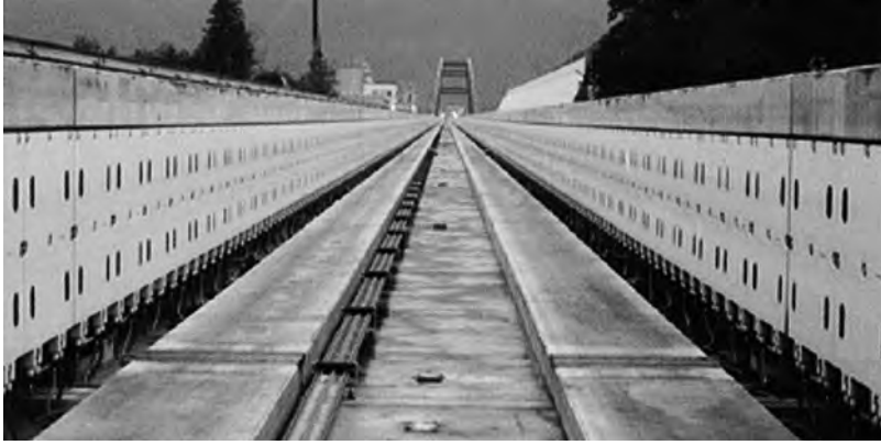
Fig. E1.2 An image of the guideway for the Yamanashi maglev test line in Japan

Adapted from: Bonsor, Kevin. "How Maglev Trains Work" 13 October 2000. HowStuffWorks.com. < http://science.howstuffworks.com/transport/engines-equipment/maglev-train.htm > 11 January 2011.