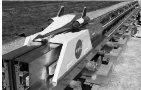
Fig. E4.1 Photo: NASA tests a linear motor on a prototype Maglev railroad, 1999. Tracks like this could be used to launch vehicles into space in future.

Linear motors are electric motors that produce motion in a straight line rather than rotational motion. In a traditional electric motor, the rotor (rotating part) spins inside the stator (static part); in a linear motor, the stator is unwrapped and laid out flat and the “rotor” moves past it in a straight line. Linear motors often use superconducting magnets, which are cooled to low temperatures to reduce power consumption.