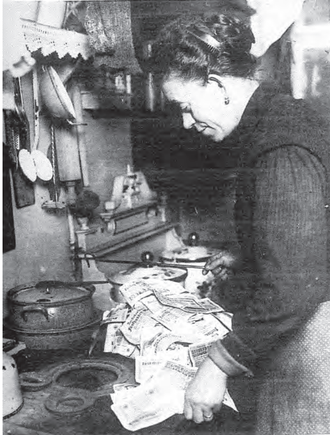
A woman using banknotes to start her fire in 1923.