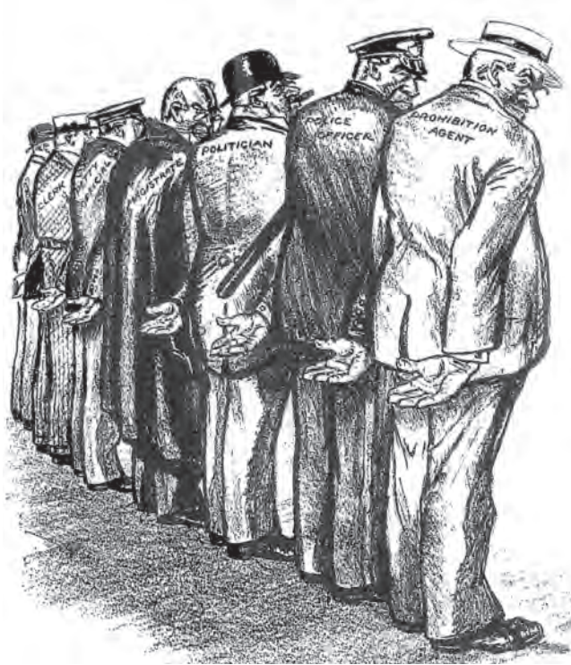
A cartoon from the Prohibition era entitled 'The National Gesture'.

13 Study the cartoon, and then answer the questions which follow.